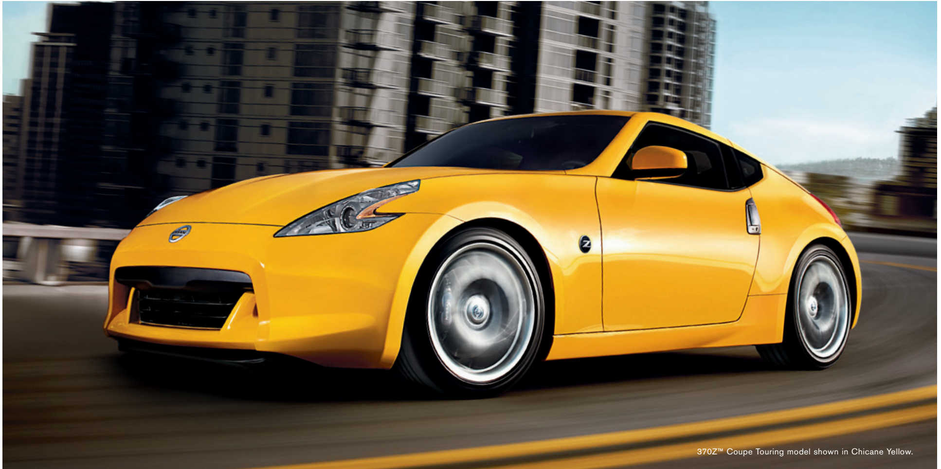
370Z™ Coupe Touring model shown in Chicane Yellow.